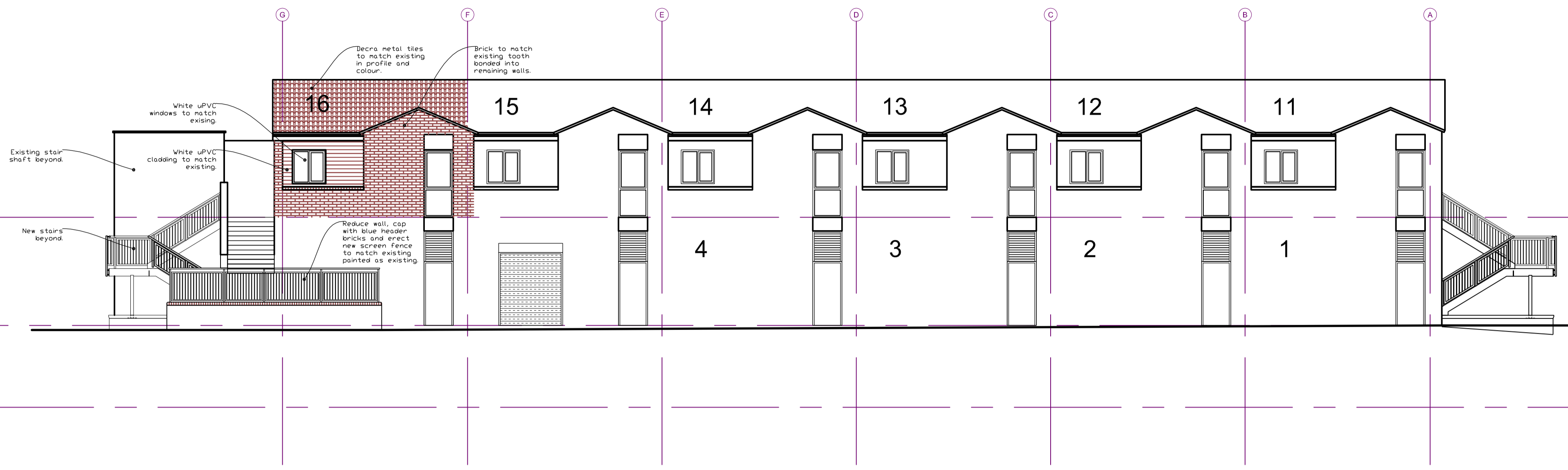
East Elevation - Maxwell Street