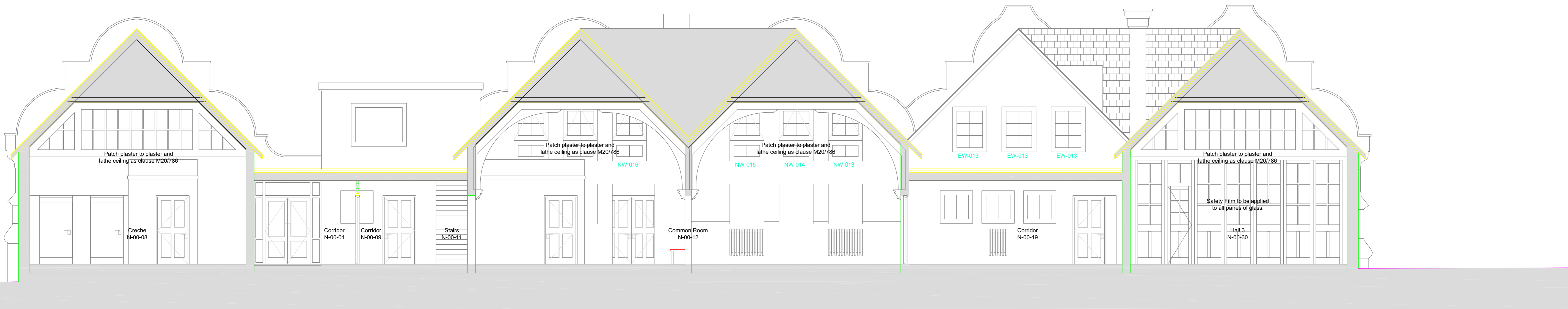
Section D-D Scale 1:50