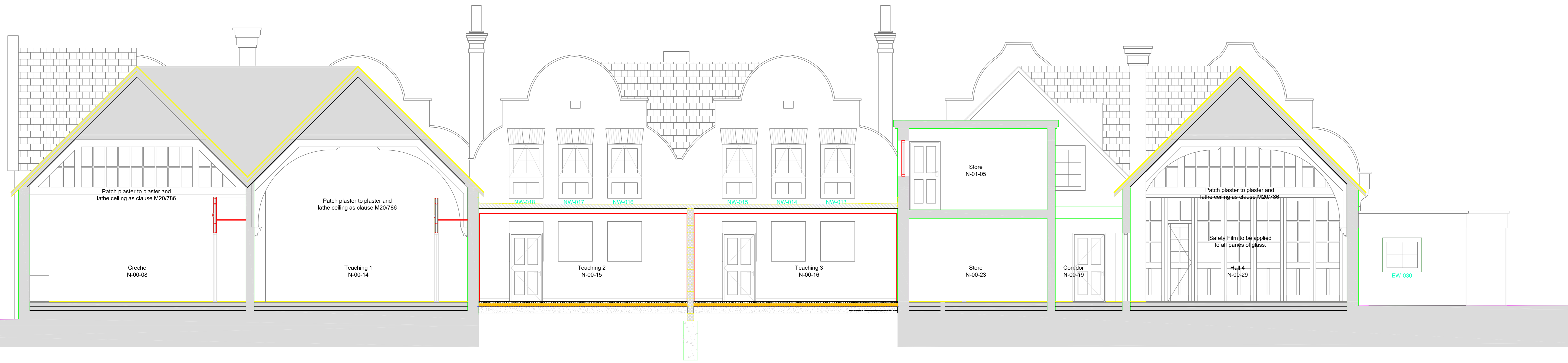
Section B-B Scale 1:50