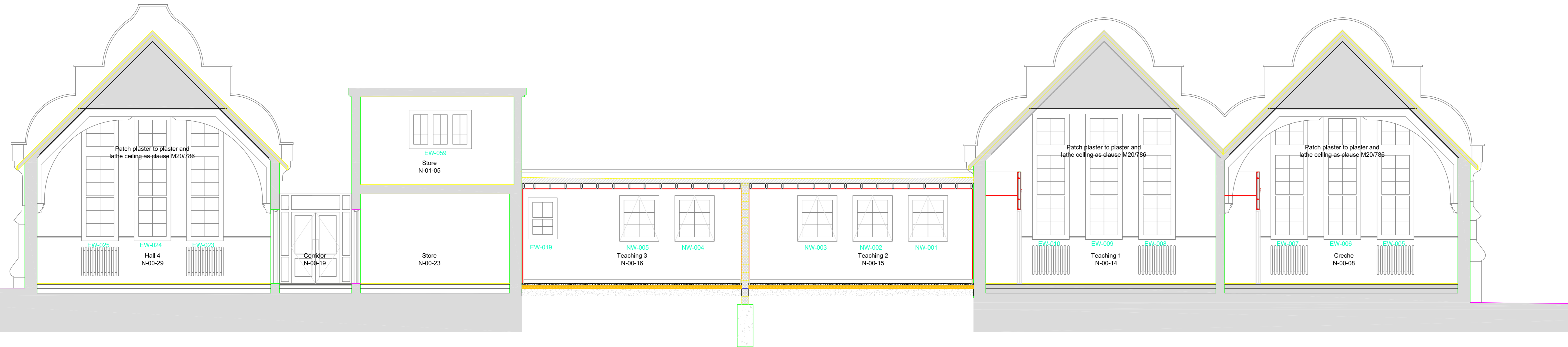
Section A-A Scale 1/20