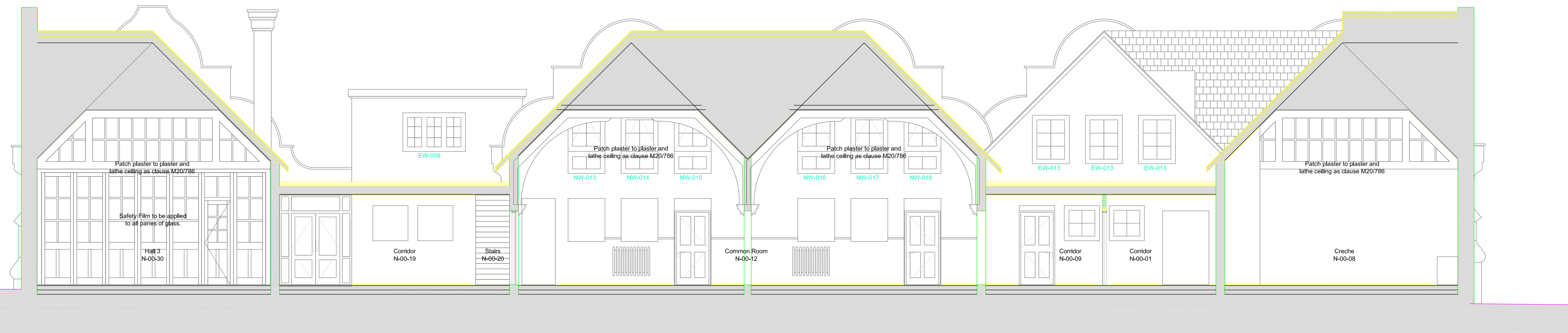
Section C-C Scale 1/20